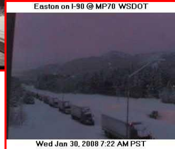
Wed Jan 30, 2008 7:22 AM PST

So, when the “unexpected” happens are you, your family, friends and co-workers prepared to sustain life for 72-hours in home, vehicle, school, and/or office?