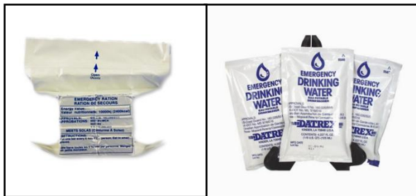
Emergency Food and Water with 5-year shelf life