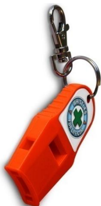
Whistle for Life