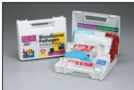
Blood Borne Pathogen/ Bodily Spill First Aid Kit (23 piece) FA214-U