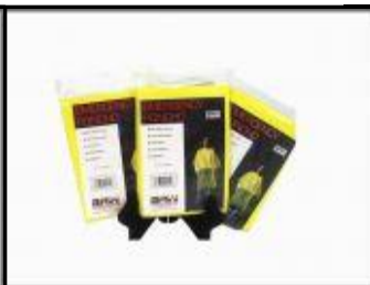
Poncho with hood