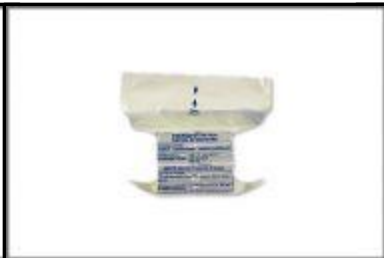
Food Bar-2400 calorie 5-year shelf life- US/Canadian Coast Guard approved