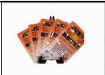
12 & 18 hour heat packs