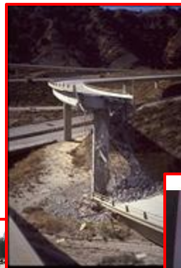
Easton on I-90 @ MP70