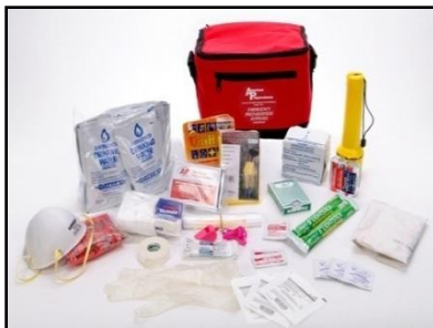
(250) 1-person/72 hour kits

Survival, Work and Sandbagging Equipment*