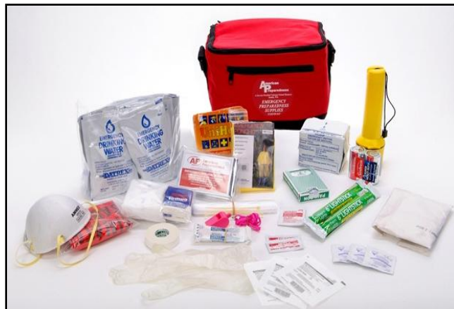
7201 –72 hour 1-person kit