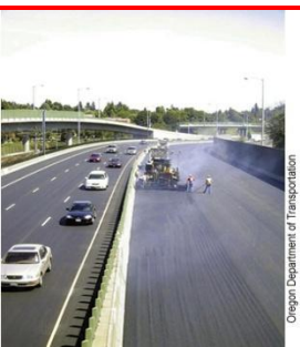
Oregon Department of Transportation

A division of : Success Marketing, Inc. 17800 Des Moines Memorial Drive Suite D Seattle, WA 98148 Office: (206) 431-1376 Toll FREE: (888) 431-4511 Fax: (206) 431-2075