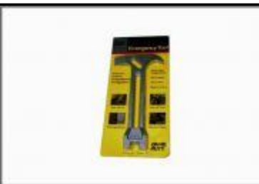
4-in-1 Emergency Shut-off Tool