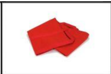
Canvas Stretcher w/ 8 hand-holds