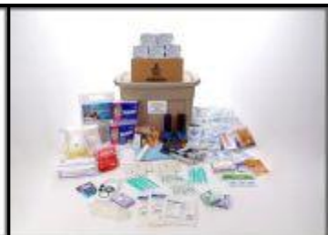
5 & 10 person group tubs