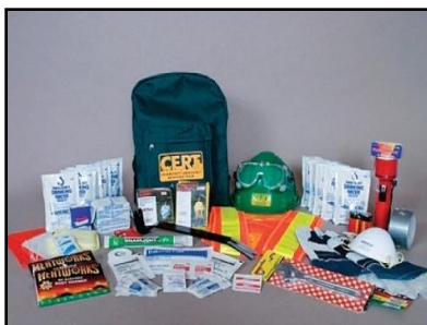
(250) CERT Kits