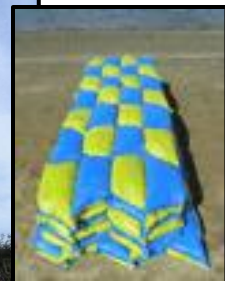
(25,000) Sand Bricks™ - Sandbags