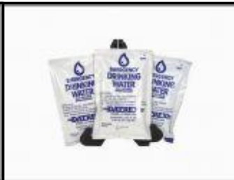
Water Pouches 5-year shelf life- US/Canadian Coast Guard approved